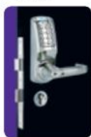
CL5020 Mortice Lock with Key Override Code lockout by deadbolt operation and safety feature to prevent accidental lock-ins